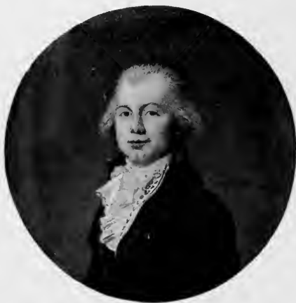
James Monroe By Sené Page 129